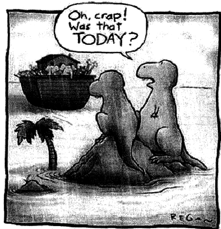
The first senior moment.